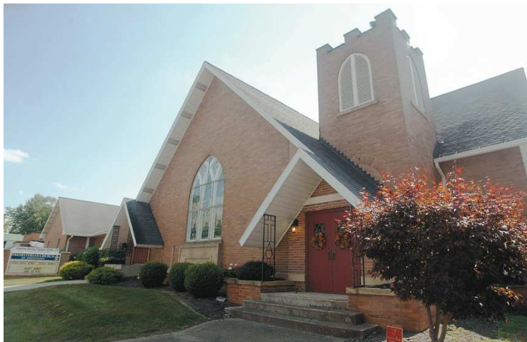
The Presbyterian Church Of Johnstown